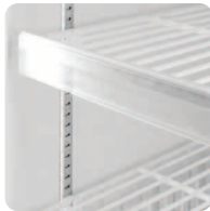
Clear, Hinged Menu / Price Strips