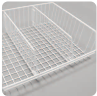
Wire Baskets and Dividers